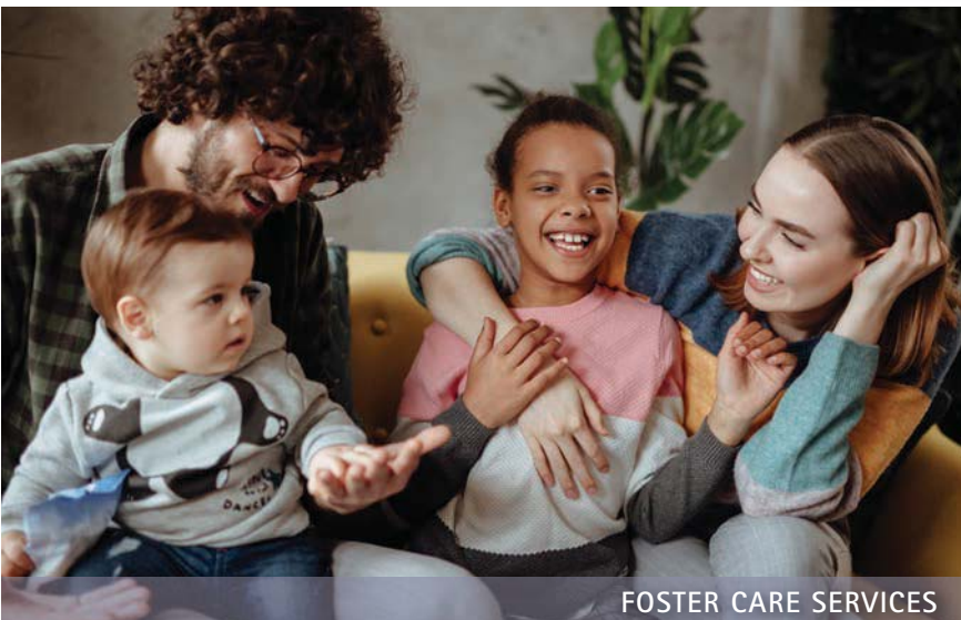
FOSTER CARE SERVICES