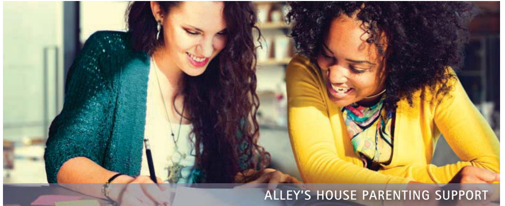
ALLEY'S HOUSE PARENTING SUPPORT